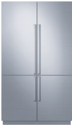
DRF485300AP/DA - Panel Ready